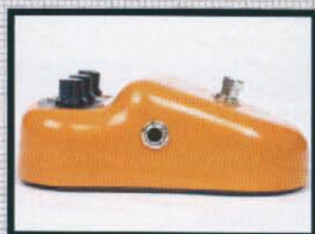
...the out on the left as is standard for FX