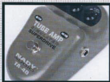
Ins and outs are to the right and left...