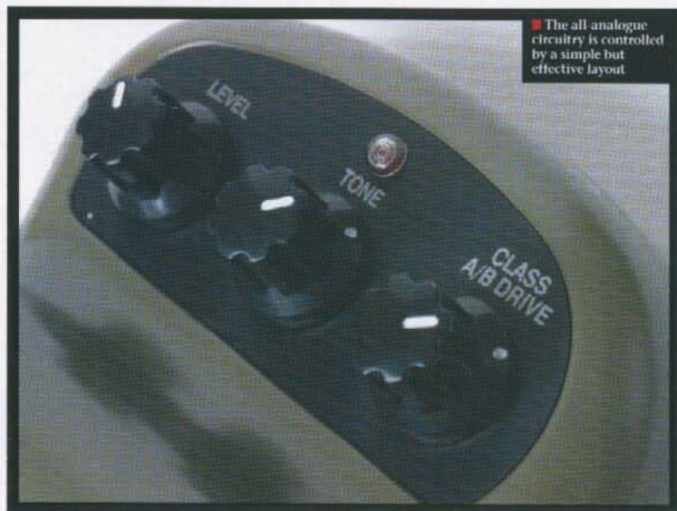
The all analogue circuitry is controlled by a simple but effective layout

Instead of the 'drive' pot on the TA-30, here we're offered a control labelled Classic A/B Drive. Where the