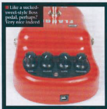
Like a sucked-sweet-style Boss pedal, perhaps? Very nice indeed

With 'rate', 'wave' and 'depth' pots the TR-20 lets you get close to such memorable sounds. The signal path is nicely transparent leaving your guitar's tone intact. If we'd like to see an improvement it'd probably be in making the LED power indicator flash to give a visual indication of trem rate. It's not hard to set the desired speed, though, nice and gentle for a Leslie effect works well with some overdrive added, for instance. In terms of price and features it's comparable with Boss's venerable TR-2 and so represents worthy competition.