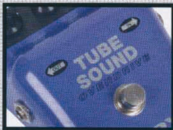
Each pedal benefits from sturdy switches

A WELCOME VISUAL DEPARTURE FOR STOMPERS, WITH SOME CREDIBLE TONES TOO